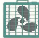
20 x 20" box fan (2012 model or newer)